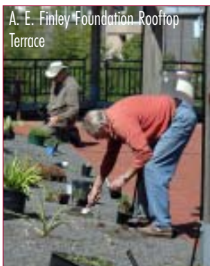
A. E. Finley Foundation Rooftop Terrace