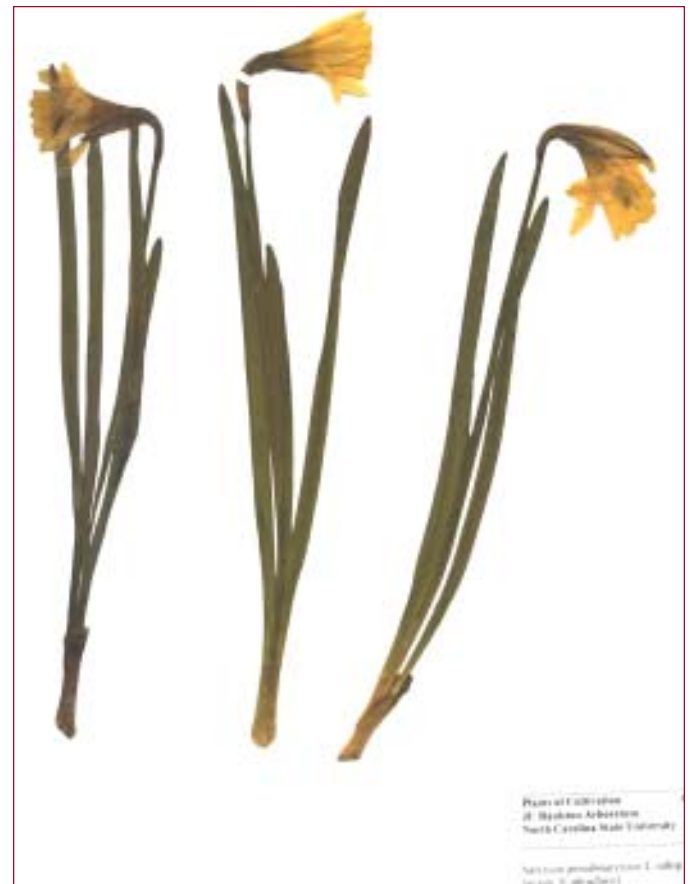
Above: One of over 125,000 herbarium vouchers at NCSC.