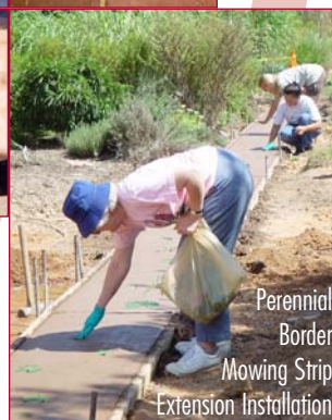
Perennial Border Mowing Strip Extension Installation

My habitual Wednesday morning construction meetings were ending after 1.5 years! Met a lot of good people but happy to get that time back. I became very familiar with "change orders" and the various interpretations of blueprints; and learned that one person's substitution may not be what the other person has in mind.