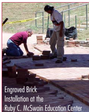
Engraved Brick Installation at the Ruby C. McSwain Education Center

I literally found myself amidst an unexaggerated, noisy whirlwind of activity and transition at the JCRA today. Within a 24-hour period, furniture was arriving, patios and engraved bricks were being installed and re-installed, dinosaur-like claws were ripping through absolutely the worst soils I'd ever seen, old buildings were being demolished, telephones were on the brink of installation, the York Auditorium was being changed to accommodate an incoming group, visitors were deciphering new and temporary pathways to the east JCRA, and volunteers were seemingly undaunted by it all as they crisscrossed through the new spaces in the west. I actually stood motionless in the new parking lot to take it all in; it was almost paralyzing as I pondered the scope of this construction project and the potentially fabulous impact it will have. All I needed was a backdrop of the "Rudy" soundtrack or a cut from a Tim Janis album to accompany and complete the experience. As a kid I used to purposely spin like a dervish, then fall to the ground to alleviate my dizziness, laughing hysterically...you know you've done that before! Well, standing in that parking lot that day was not too different.