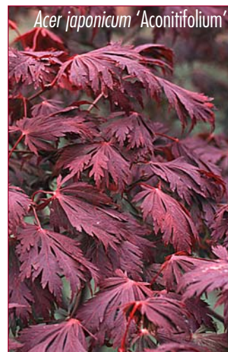
Acer japonicum 'Aconitifolium'

Japanese stewartia ( Stewartia pseudocamellia ) and the cutleaf fullmoon maple ( Acer japonicum 'Aconitifolium') also tend to provide a lot of excitement in their respective sites. Stewartia is a lovely mid-summer bloomer with 2-3" white, camellia-like blossoms. It warms the landscape in autumn with brilliant yellows and red-oranges as the leaves change, and offers outstanding exfoliating bark for winter interest. The cutleaf fullmoon maple makes a terrific statement as a focal point with its interesting form and