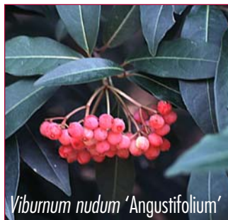
Viburnum nudum ‘Angustifolium’

Two selections of Viburnum nudum have been of great interest to us. ‘Winterthur’ was grown side by side with ‘Angustifolium’, with the latter advertising a semi-evergreen nature. Large waxy green foliage, an abundance of fragrant white blossoms, and handsome reddish-purple fall foliage that makes one year for a nice glass of red wine in front of the fireplace was virtually the same on each plant. The difference, however, is discernible in winter. In mid-December, ‘Angustifolium’ is fully clothed, while ‘Winterthur’ stands shivering in the nude.