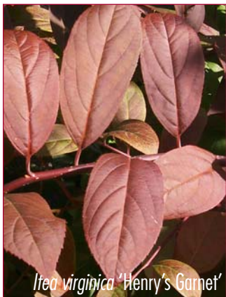
Itea virginica 'Henry's Garnet'