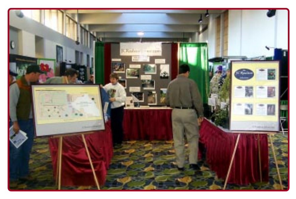
Above: The JC Raulston Arboretum's booth at the North Carolina Association of Nurserymen's Green & Growin' Show & Floral Exposition.

5) Cotinus coggygria 'Ancot' — Golden Spirit<sup>™</sup> goldleaf smokebush — As one of the most exciting new woody plants to hit the ornamental market in years, the goldleaf smokebush is sure to garner high sales in the U.S. To guard against theft of our only plant, procured in the U.K. in 1999 and now planted out in the Arboretum, we decided to propagate several (hopefully unneeded) "replacements."