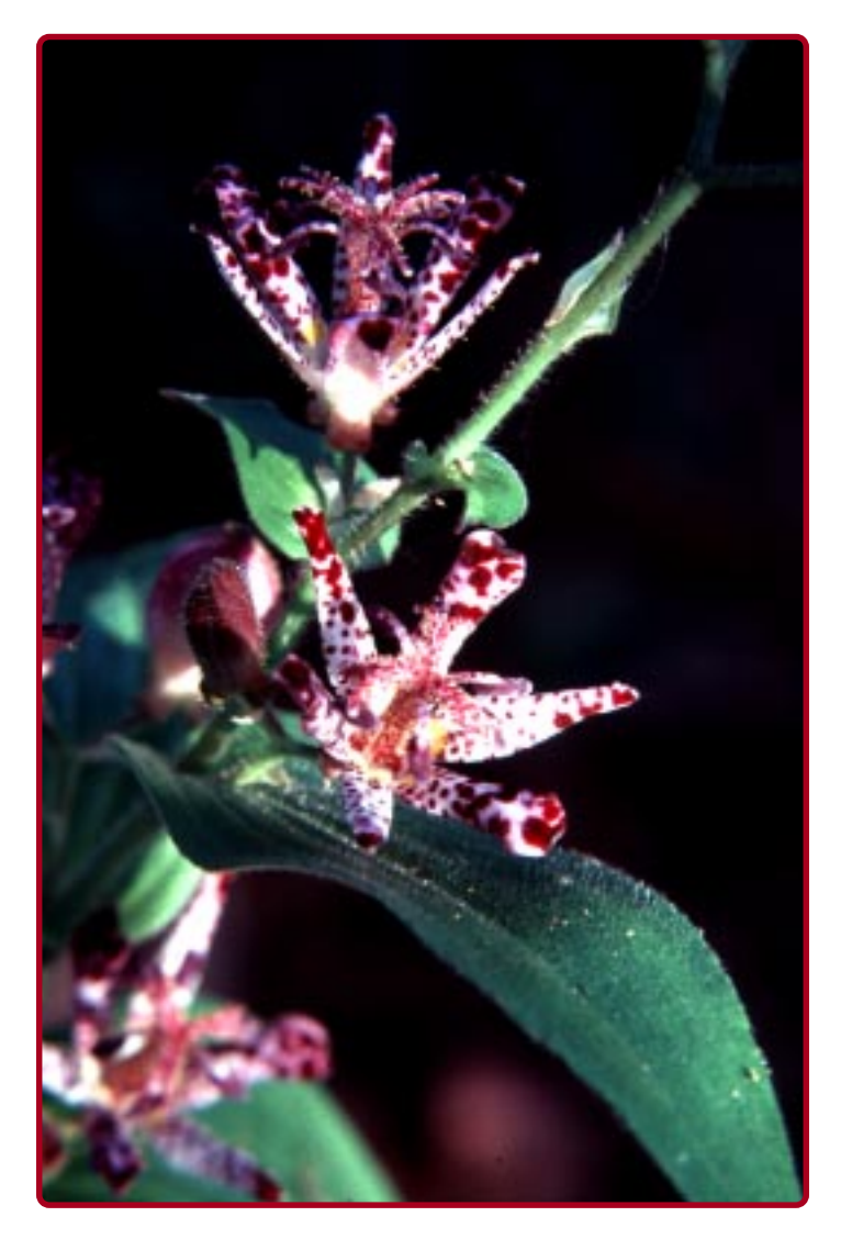
Above: The class' favorite photograph from the Horticultural Photography Workshop. Tricyrtis sp. - toad lily

The first Horticultural Photography Workshop was a terrific success, perhaps too much so! The event booked up solid within a few hours of posting to my e-mail list. However, we're doing it again in spring, and be sure to take a look the class' favorite photograph stemming from that workshop. It was chosen by the class in a tiebreaking fashion! Other photographs are posted near 162 Kilgore and at the entry to the JCRA.