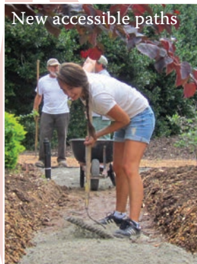
New accessible paths

“The future ain’t what it used to be.” I have always enjoyed this Yogi Berra quote. The quote comes to mind when I read the new Blue Ridge Road District Study Draft. The document is a May 2012 draft for concepts of the future major changes along the Blue Ridge Corridor, which is just peripheral to the location of the JC Raulston Arboretum on Beryl Road. The area, loosely bounded by Lake Boone Trail, Interstate 440, Western Boulevard, and Edwards Mill Road, is considered the western gateway to Raleigh, sitting on Cary’s doorstep. Many local developers have predicted that the area will become a bustling entertainment district brimming with restaurants, hotels, shops, and new office buildings with the PNC Arena, Carter-Finley Stadium, and the North Carolina State Fairgrounds, driving the transition from pine trees, pastures, and state department depots and storage facilities that currently occupy much of the landscape. Obviously, some transition has occurred, but another Yogi quote might also be appropriate, “You can observe a lot by watching.”