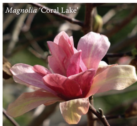
Magnolia 'Coral Lake'