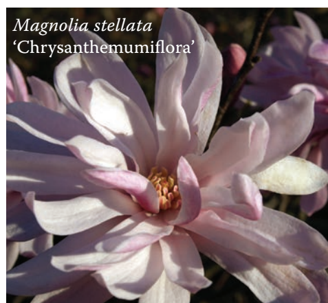
Magnolia stellata 'Chrysanthemumiflora'