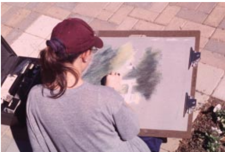
The Klein-Pringle White Garden is enjoyed by many people. Here, an art student from Meredith College draws the gazebo.